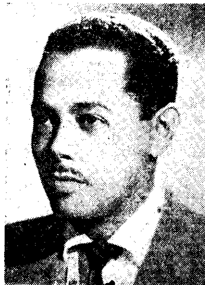
BILLY ECKSTINE, one of America's leading light vocalists, who is the "Evening Star" to be heard from 1ZB at 5.2 this evening