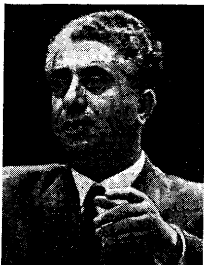
ARAM KHACHATURIAN , who conducts the Philharmonia Orchestra in excerpts from his own suite "Gayaneh," to be broadcast by 3YC at 7 o'clock this evening