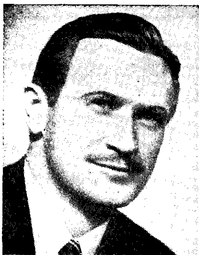
EUGENE CONLEY (tenor) sings operatic arias from 4YC at 8.59 tonight