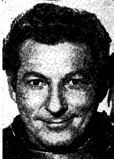
DANNY KAYE is featured in 1XN's morning programme at 10.30