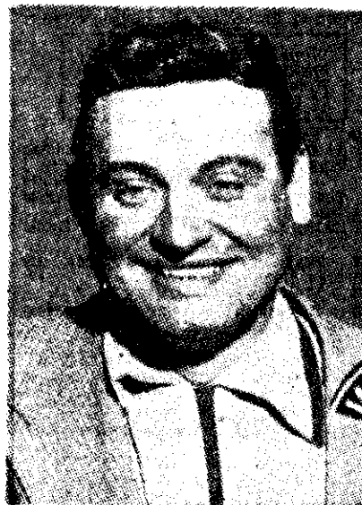
FRANKIE LAINE will sing tonight from 2XB at 9.45