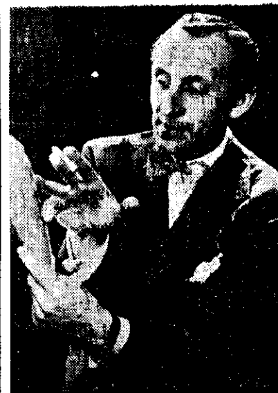
VLADIMIR HOROWITZ (piano) will play this evening from IYC at 8.30