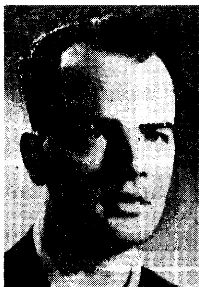
CROMBIE MURDOCH'S Orchestra can be heard at 7.0 this evening from IYD