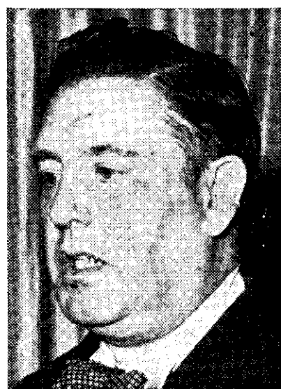
JOHN MCCORMACK (tenor) sings at 4.30 this afternoon from IYA