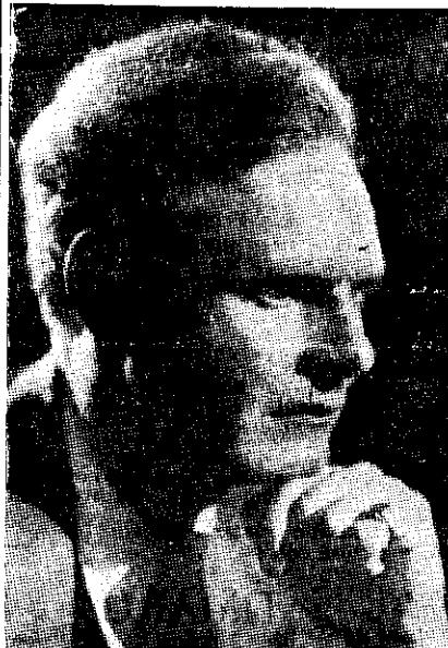
GEORGE WELDON conducts the London Symphony Orchestra which plays music by Holst at 8.0 tonight from IYC