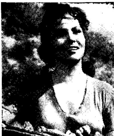
GINA LOLLOBRIGIDA A genuine primitive charm

its other characters are a young carabinieri who's a rival for the Bersagliera's heart, the usual gossips, the priest, Luigi Comencini directed, and the apt and lively score is by Alessandro Cicognini.