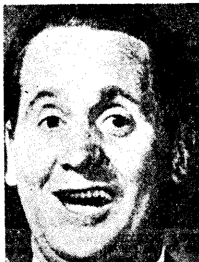
LES PAUL (guitar) is featured in IYD's evening programme at 5.40