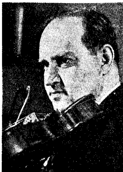
DAVID OISTRAKH (violin) plays Violin Concerto, Op. 99, by Shostakovich, at 9.3 tonight from 2XG

While Parliament is being broadcast the programmes from 2.0 to 4.30 p.m. will be transferred to Station 2YC