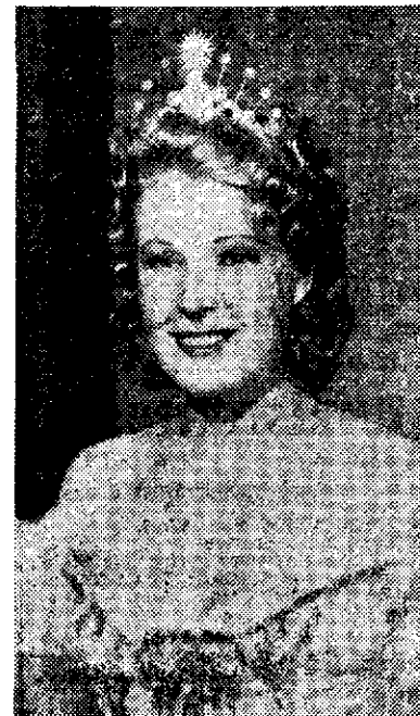
MILIZA KORJUS (soprano), who is featured in IXN's Women's Hour at 9.0 this morning