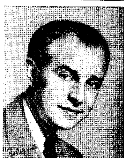
ERICH KUNZ (baritone) is featured in 2YA's evening programme at 7.30