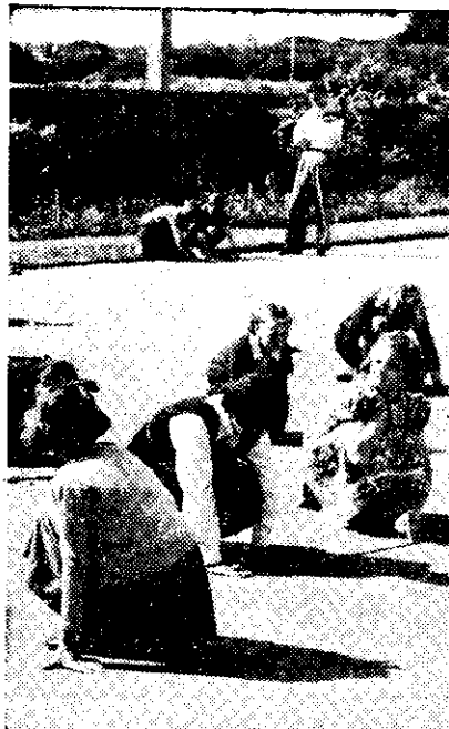
CHILDREN in the playground carry out class instruction in mensuration, supervised by a student teacher (in background).

chology to the legal aspect of teaching. But the staff considers that in two years the chief job is to equip a student with the right attitudes to be a successful teacher."