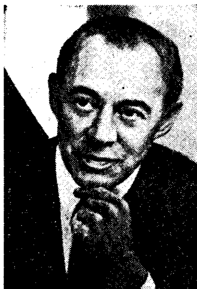
RICHARD RODGER'S music is featured in 1XN's evening programme at 9.17