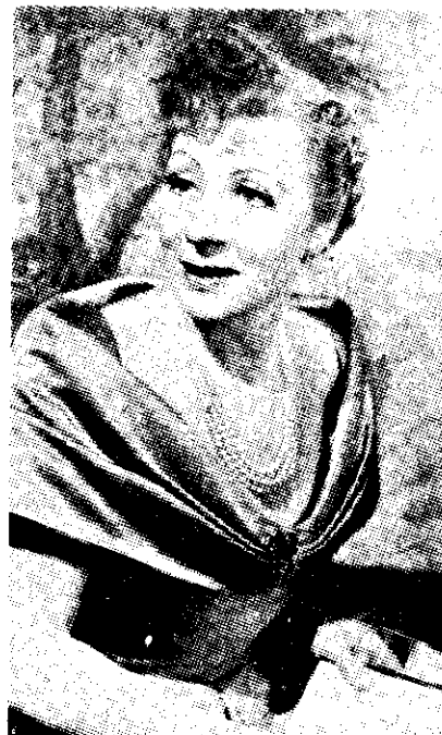
DAME EDITH EVANS reads Sonnets by Shakespeare at 10.15 tonight from 2YC