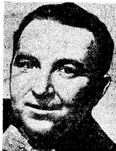
OWEN BRANNIGAN (baritone) sings at 8.28 tonight from 1XN