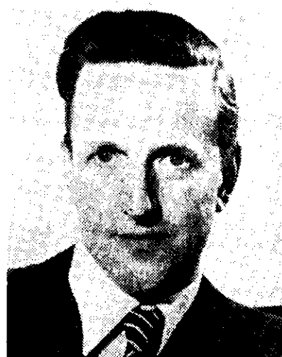
PETER PEARS (tenor), who, with Benjamin Britten (piano), can be heard at 7.19 this evening from 4YC