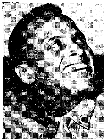
HARRY BELAFONTE sings at 6.45 this evening from 2XG