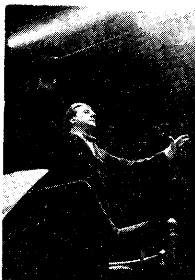
SIR JOHN BARBIROLLI, conductor of the Halle Orchestra, which is featured in 3YC's evening programme at 8.15