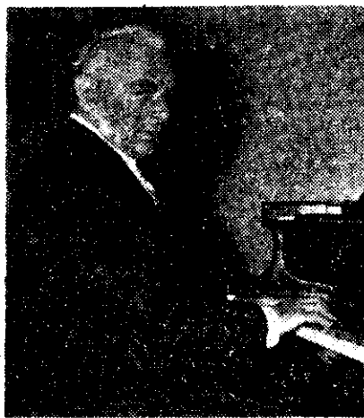
IGNAZ FRIEDMAN (piano) can be heard at 10.32 tonight from IYA