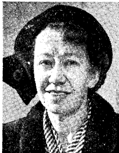
FLORA ROBSON reads extracts from "Meditation on the Passion of Our Lord," by Jean Peguy, at 7.0 this evening from 3XC