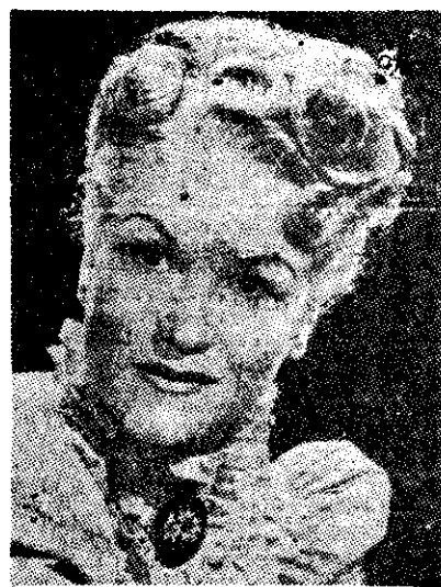
DOROTHY KIRSTEN sings songs of George Gershwin from 2YA at 5.50 this evening

7.30 Clifford Curzon (piano) with the National Symphony Orchestra of England Piano Concerto No. 1 in D Minor, Op. 15 Brahms