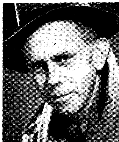
FRANK SARGESON, who gives a talk entitled "The Play and the Playwright," at 8.40 tonight from 4YC