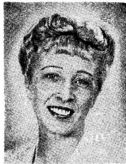
SUZANNE DANCO sings songs by Ravel at 8.30 tonight from 2YC