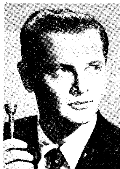
LES ELGART'S Orchestra can be heard at 5.45 this evening from IYD