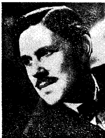
ALFRED DELLER, who sings at 9.16 tonight from 4YC