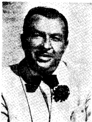
XAVIER CUGAT, who is featured by 2ZA at 9.30 tonight