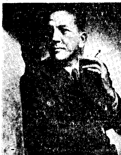
NOEL COWARD, featured in 3ZB's Composer and Artist programme at 2.15 p.m.