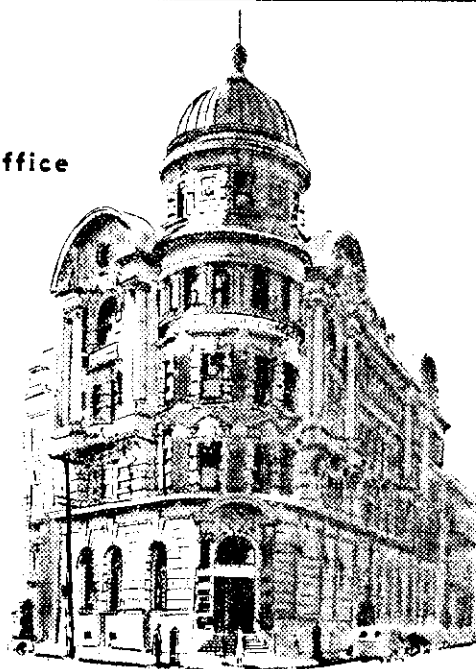
Head Office Wellington

With over eighty-two years' experience in every phase of trustee duties the Public Trust Office is especially qualified to administer your Estate.