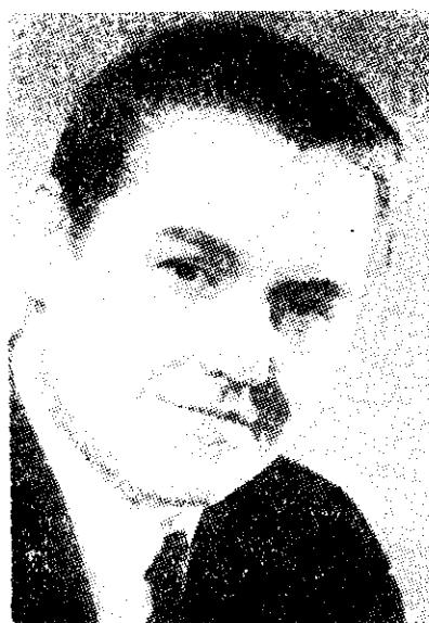
JUSSI BJORLING (tenor) sings from 1ZB at 1.45 p.m.