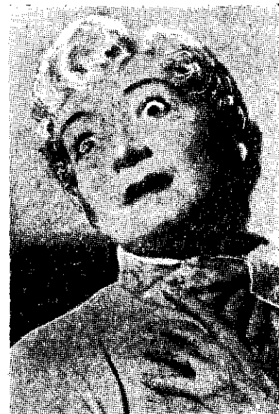
FLORENCE DESMOND Three variations