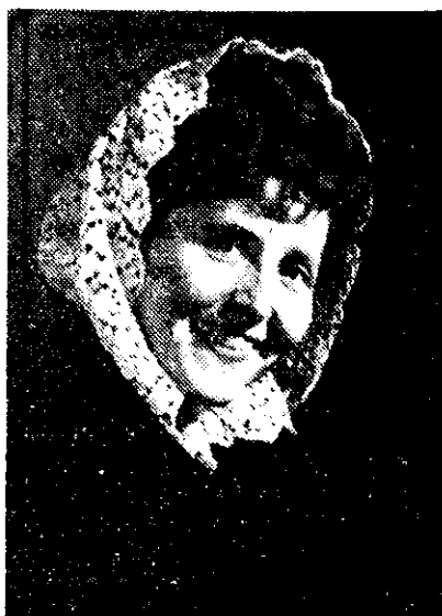
LILI KRAUS (piano) plays a Schubert Sonata from 3YC at 9 o'clock tonight