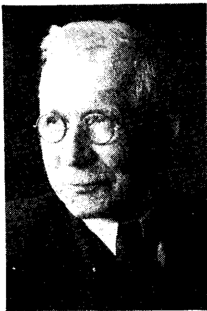
WALTER MURDOCH "A scholar without being a snob"