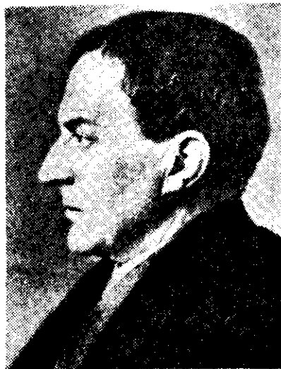
WALTER DE LA MARE

railway, leads the listener to a hideous and neglected house in a dingy alley off the Thames Embankment. Guided to this deserted spot by an evil-faced figure, the narrator is persuaded by what he finds there that the priceless blessing of repentance is not denied us, even after all earthly things appear to have ended.