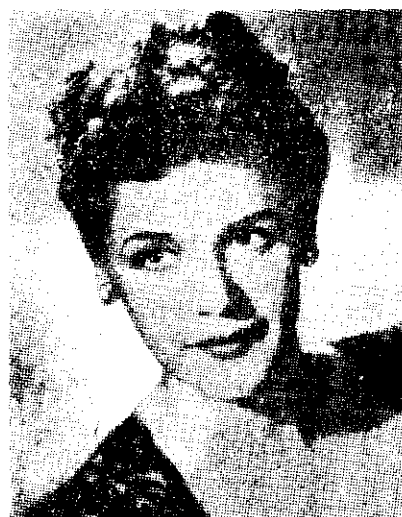
ELEANOR STEBER sings Elsa in Lohengrin over 3YC from 7.20 this evening