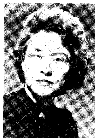
CHERRY discusses Christmas shopping from 1ZB at 12.30 this afternoon