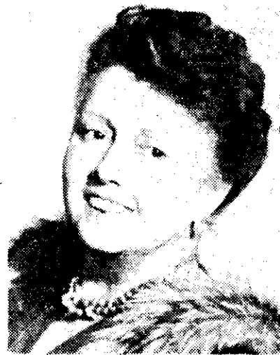
ELISABETH SCHUMANN sings Mendelssohn songs from 4YZ at 10.5 tonight