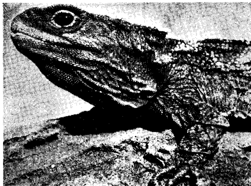
HEAD OF TUATARA—its voice is surprisingly loud

The party spent some nights on Sanctuary Island, which carries a prolific and interesting wild life. All of