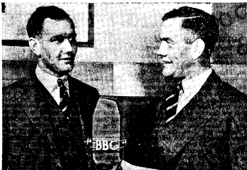
THE CRICKETING BEDSERS