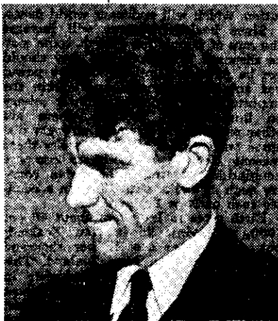
SIR EDMUND HILLARY