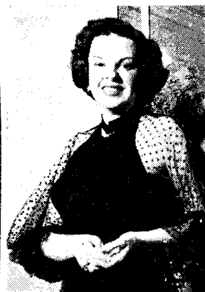
JUDY GARLAND broadcasts with Fred Astaire from 2ZB at 5.30 this afternoon