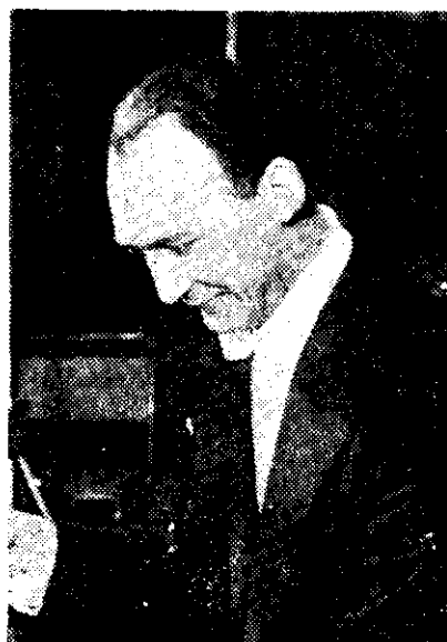
SEMPRINI plays from 1ZB at 5.45 p.m. today