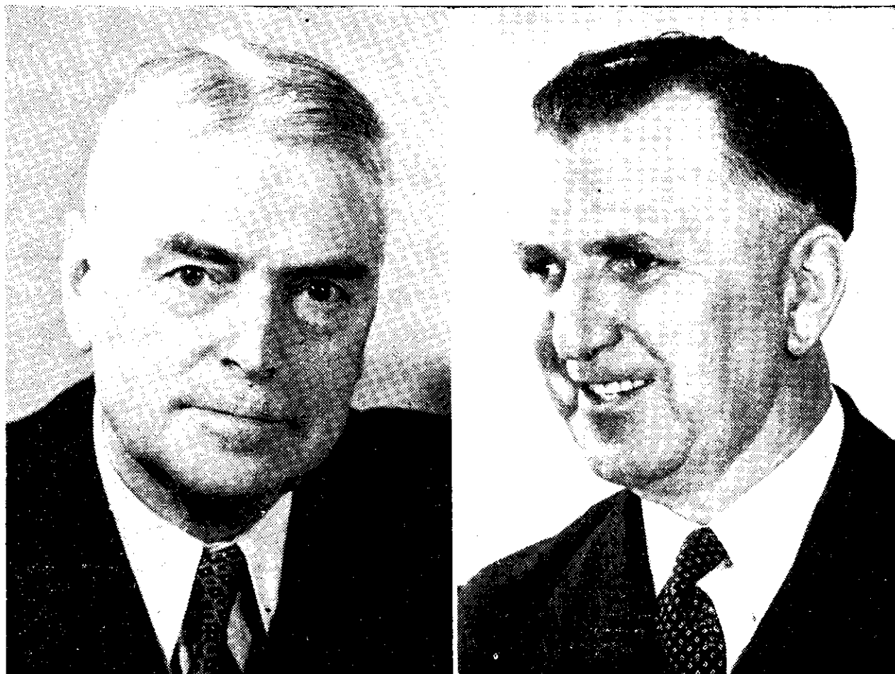
RT. HON. WALTER NASH