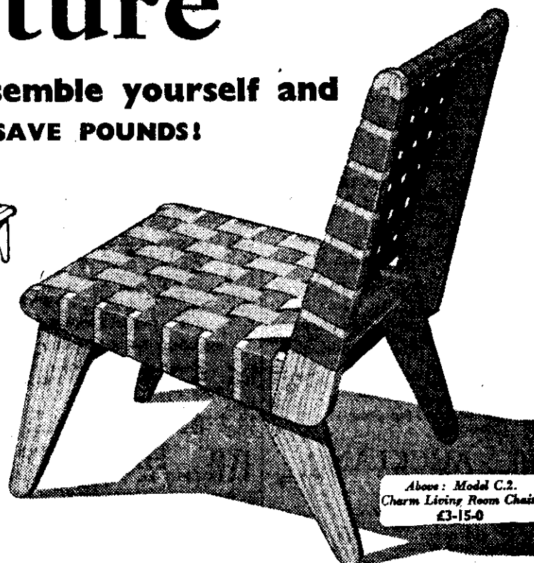
Above: Model C.2. Charm Living Room Chair. £3-15-0