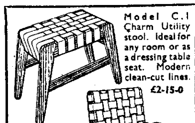
Model C.1 Charm Utility stool. Ideal for any room or as a dressing table seat. Modern clean-cut lines. £2-15-0