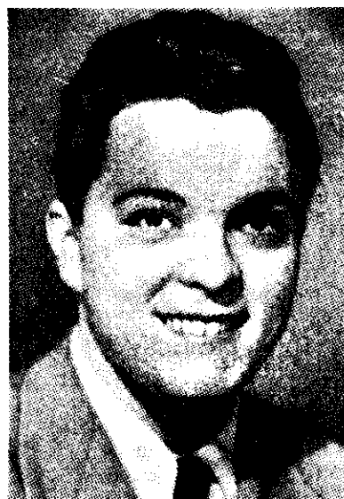
DICKIE VALENTINE, who will be on the air from 2ZA at 4 o'clock this afternoon