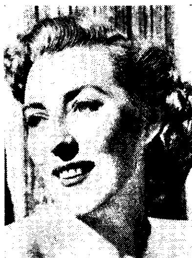
VERA LYNN, who will be heard from 3ZB at 6.15 this evening in "Vocally Yours"