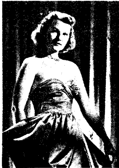
JO STAFFORD, who will be heard from 2ZA at 2 o'clock this afternoon, with Gordon MacRae