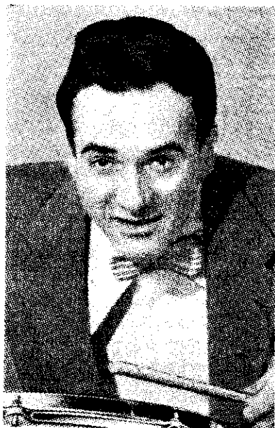
GENE KRUPA, 1ZB's "Saturday Star," on the air at 5.45 p.m.