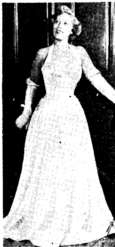
DINAH SHORE, who will be on the air from 2ZB at 4.45 this afternoon