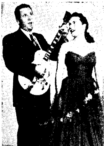
THE STARS to be heard from 2ZA at 9.30 this evening—Les Paul and Mary Ford